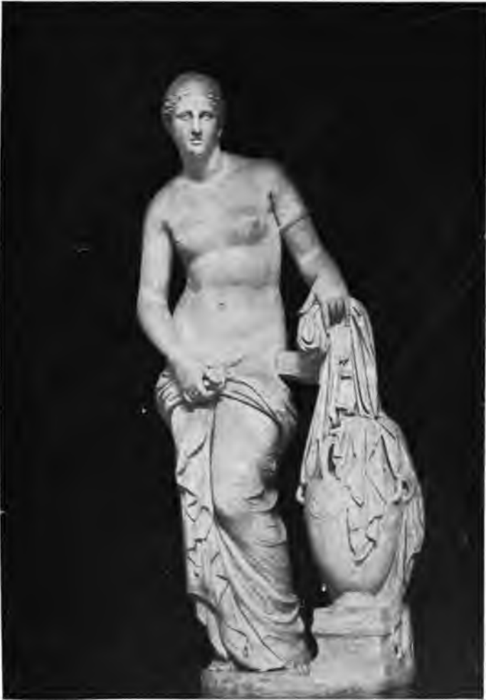
Fig. 30. Aphrodite of Knidos.